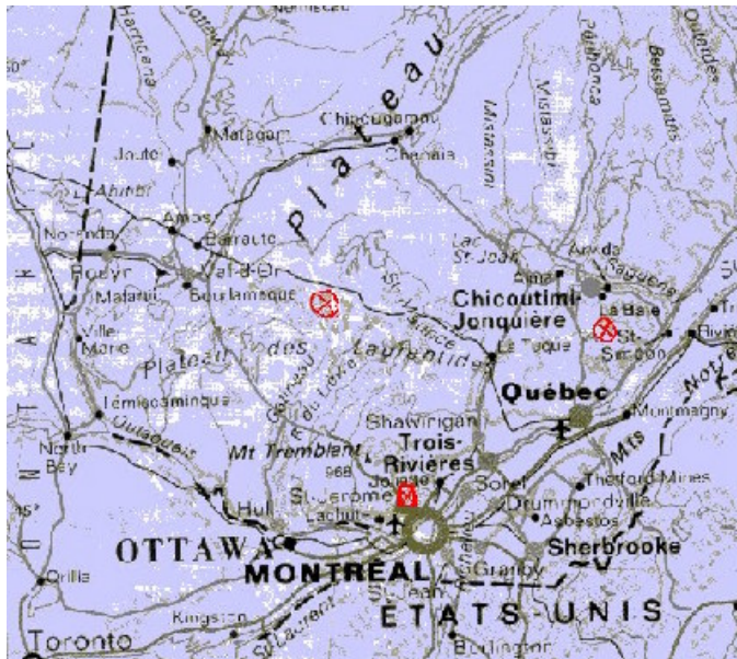
Quebec Map: Map of the province of Quebec