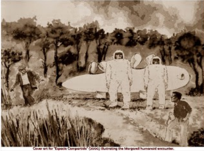
Cover art for "Espacio Compartido" (2006) illustrating the Margarell humanoid encounter.

sidecar, but as he approached, he realized that the object was a long white cylinder standing some 60 centimeters over the ground, “looking like a small submarine” – relatively speaking, as the witness placed its length at some five meters and its width at 120 cm, featuring portholes through which brown seats could be seen.