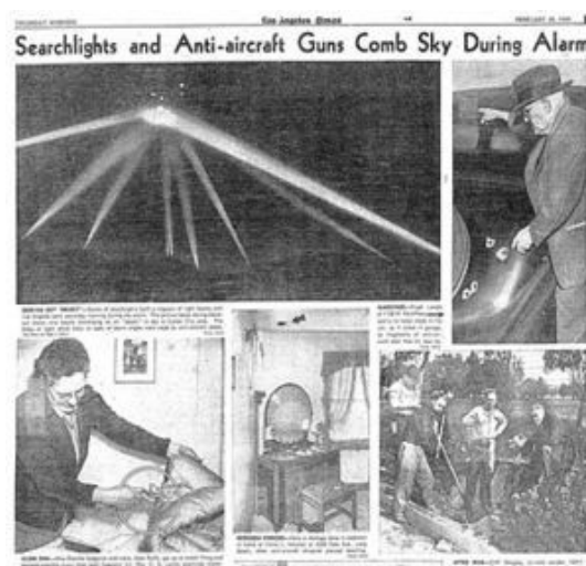
The truth is out there

http://blogs.houstonpress.com/hairballs/2012/02/ufo-s aliens battle la.php