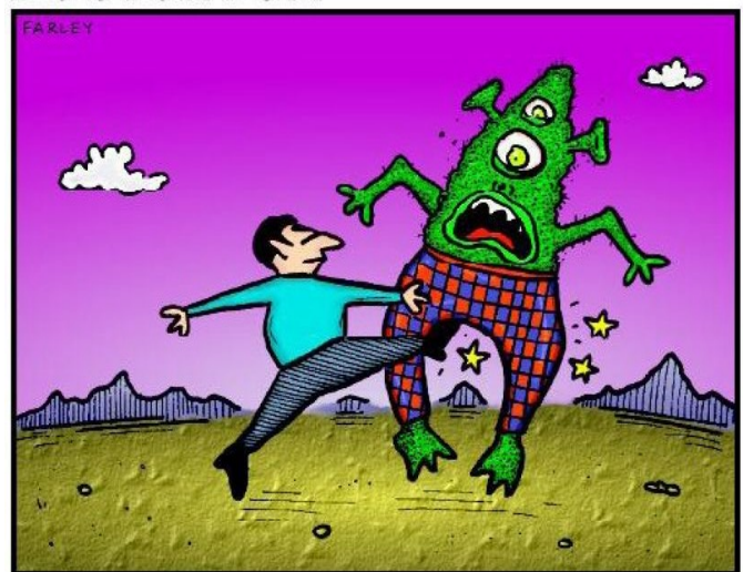
Unable to secure a grip on the hostile alien's neck, Mister Spock resorts to the effective, but lesser-known Vulcan Nut Kick.